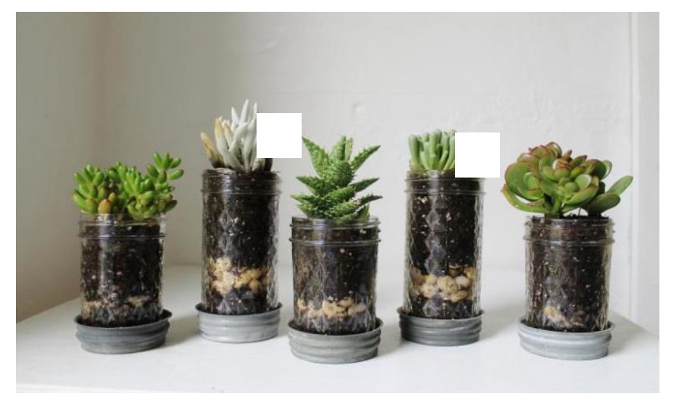
For more ideas go to http://pinaholicmyrie.com/creative-garden-container-ideas/